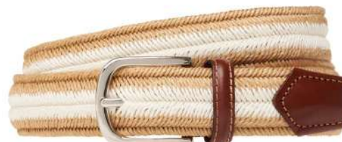
KHAKI AND WHITE