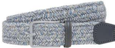
WHITE, GREY AND BLUE MELANGE