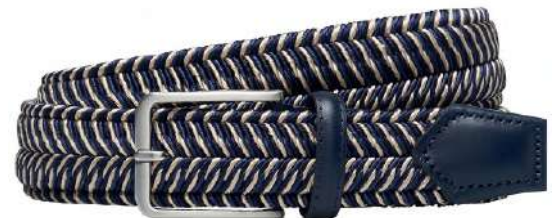
NAVY, INDIGO AND BEIGE