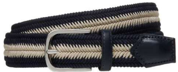
NAVY AND BEIGE