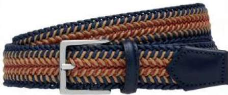
NAVY AND RUST