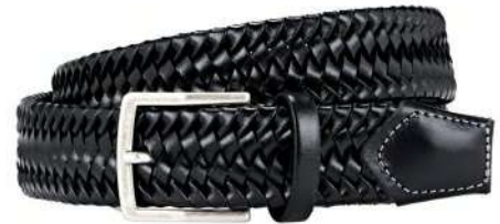
BLACK AND GREY