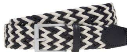
NAVY AND WHITE