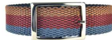
INDIGO, BURGUNDY AND CHOCOLATE BACK SIDE NAVY