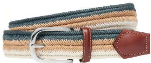
WHITE, BEIGE AND DARK GREEN