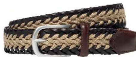
DARK BROWN AND SAND MELANGE