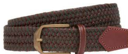
BROWN AND MILITARY GREEN