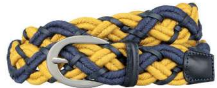
MULTICOLOR BLUE AND YELLOW