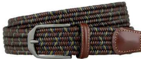
BROWN, OLIVE AND NAVY