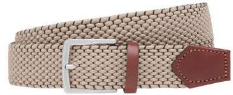
BEIGE AND DARK BROWN