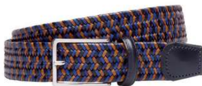
BLUE AND NATURAL