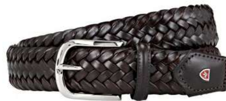
DARK BROWN AND BURGUNDY

FEATURES: no holes, metallic logo on the tip, man