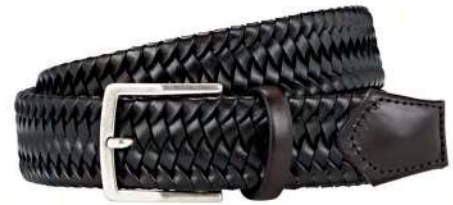
DARK BROWN AND GREEN