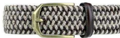
DARK BROWN AND OFF-WHITE