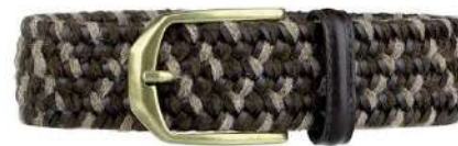
DARK BROWN AND TAUPE