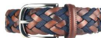
BROWN AND NAVY