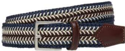
NAVY AND BROWN