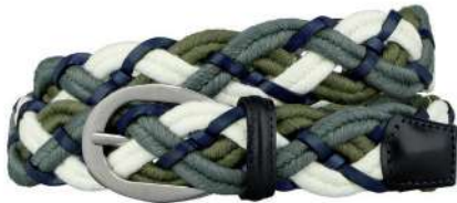
MULTICOLOR BLUE, WHITE AND GREEN