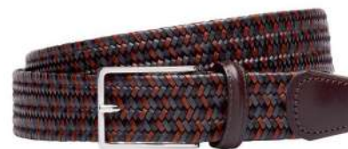
BROWN AND GREY