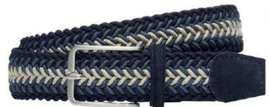
NAVY, BLUE AND WHITE