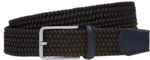
GREEN AND NAVY

The first braided belt in the world entirely made of round shaped recycled leather strings.