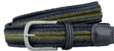
NAVY AND OLIVE