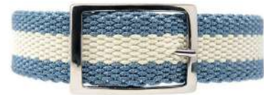
LIGHT BLUE JEANS AND WHITE BACK SIDE LIGHT BLUE JEANS

FEATURES: stretch, no holes, tubular, reversible, man