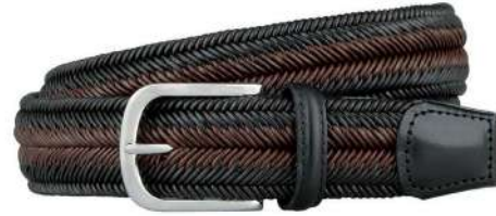
BLACK AND BROWN

The first braided belt in the world entirely made of round shaped recycled leather strings.