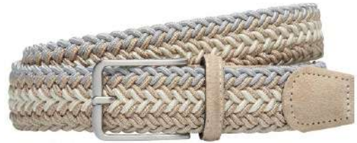
BEIGE AND WHITE