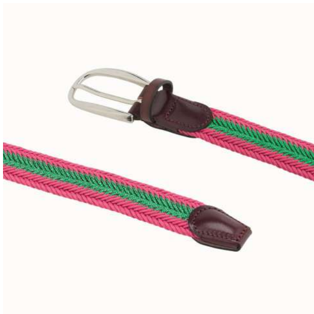
PINK AND GREEN