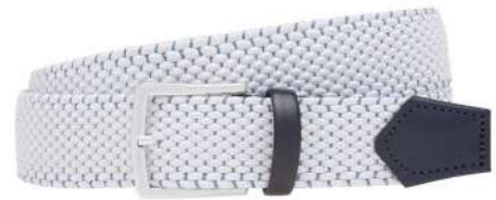
WHITE AND DENIM