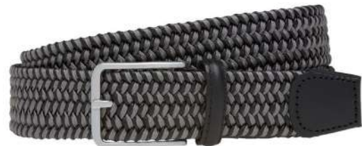
BLACK AND GREY