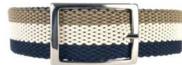
NAVY, WHITE AND KHAKI BACK SIDE NAVY