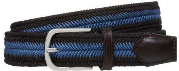
DARK BROWN AND DENIM