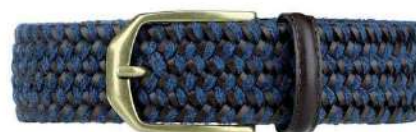
DARK BROWN AND BLUE