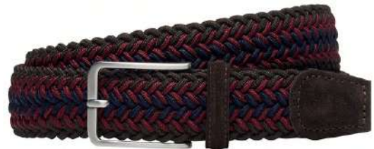
DARK BROWN, BURGUNDY AND NAVY