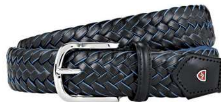
BLACK AND AVIO BLUE