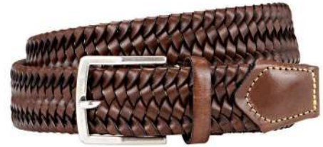
LIGHT BROWN AND YELLOW