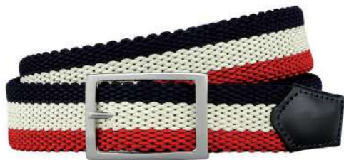
NAVY, WHITE AND RED BACK SIDE NAVY