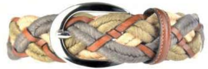
MULTICOLOR BROWN AND GREY