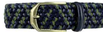
NAVY AND GREEN