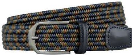
NAVY, OLIVE AND COGNAC

The first braided belt in the world entirely made of round shaped recycled leather strings.