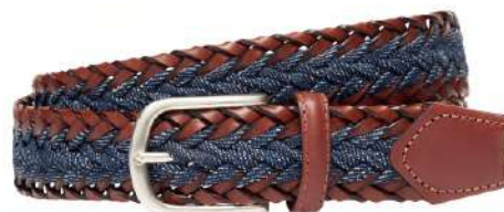
LIGHT BROWN AND BLUE JEANS