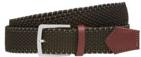
OLIVE AND OFF WHITE