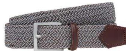
BROWN AND LIGHT BLUE MELANGE