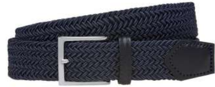
NAVY INDIGO MELANGE