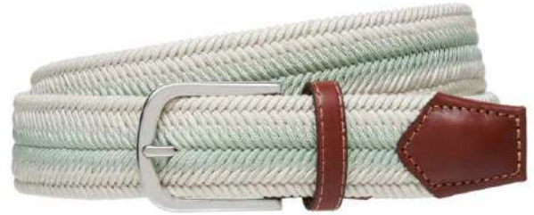
WHITE AND MINT