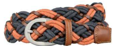
MULTICOLOR BROWN AND RUST