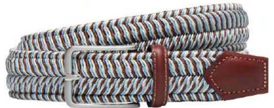
WHITE, LIGHT BLUE AND BROWN