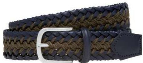
BLUE AND MILITARY GREEN