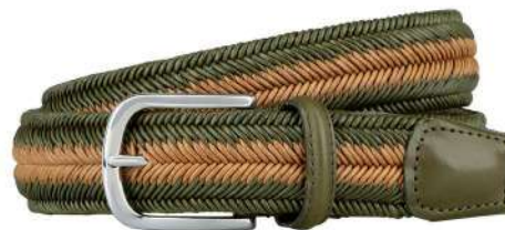
OLIVE AND NATURAL