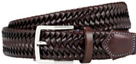
BROWN AND LIGHT BLUE