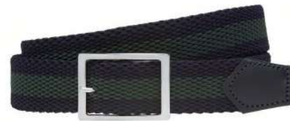
NAVY AND GREEN BACK SIDE NAVY