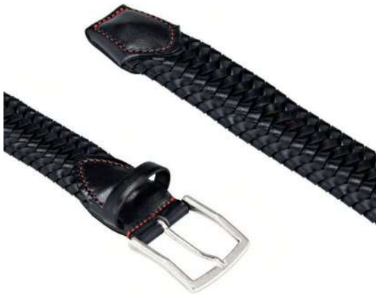
BLUE AND RED