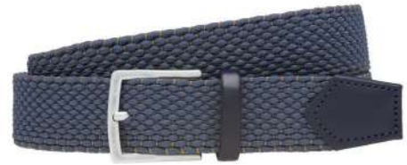
INDIGO AND BROWN