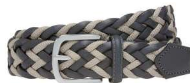
GREY AND BEIGE