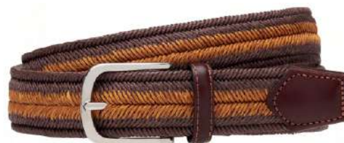
BROWN AND RUST