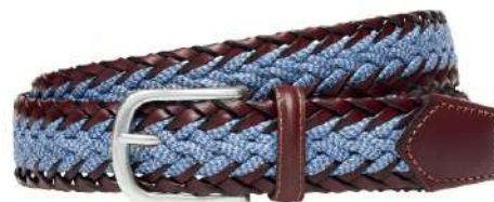
BROWN AND LIGHT BLUE MELANGE