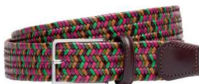
FUCHSIA AND GREEN