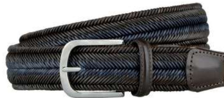
DARK BROWN AND NAVY