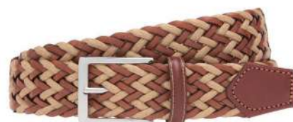
BROWN AND BEIGE