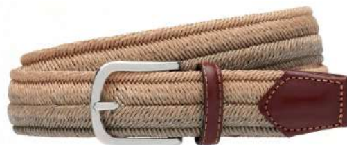
GREY AND TAUPE