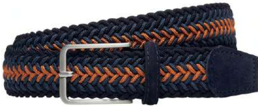
NAVY AND BURNT

FEATURES: stretch, no holes, suede details, man