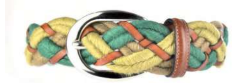
MULTICOLOR BROWN AND GREEN