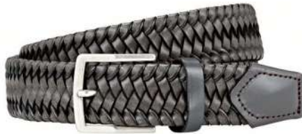
GREY AND BURGUNDY