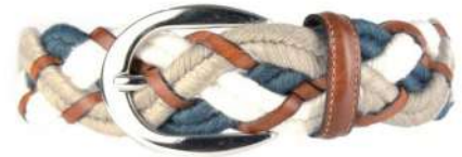
MULTICOLOR BROWN AND WHITE