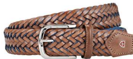
LIGHT BROWN AND AVIO BLUE