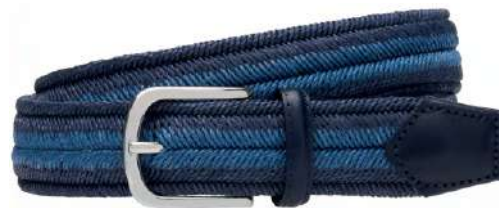
BLUE AND NAVY