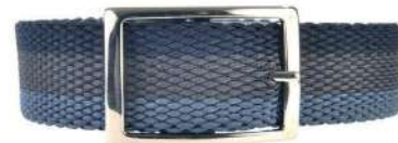
INDIGO, MANATEE AND NAVY BACK SIDE NAVY