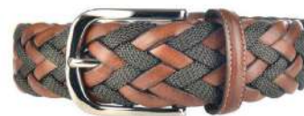
LIGHT BROWN AND OLIVE GREEN