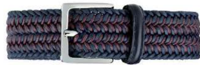
NAVY AND BURGUNDY